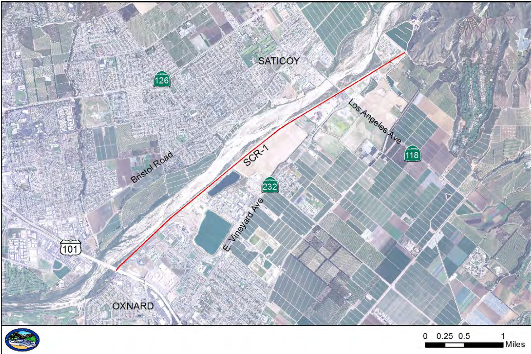
Figure 2: Santa Clara River Levee (SCR-1) Location Map