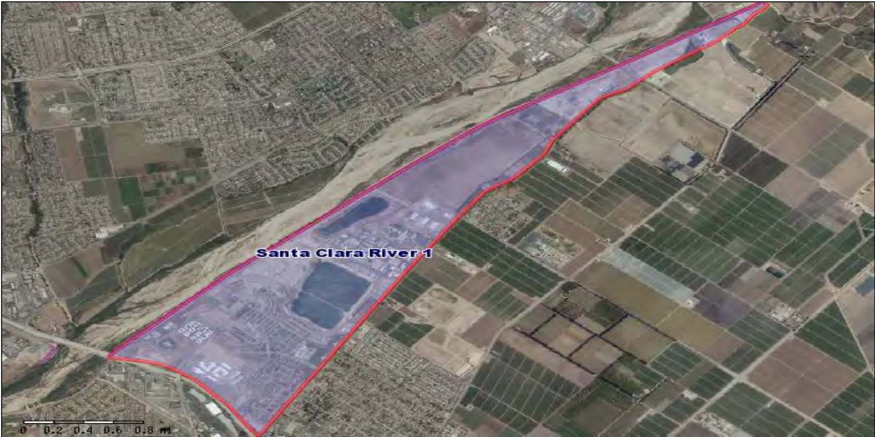
Figure 4: SCR-1 Leveed Area