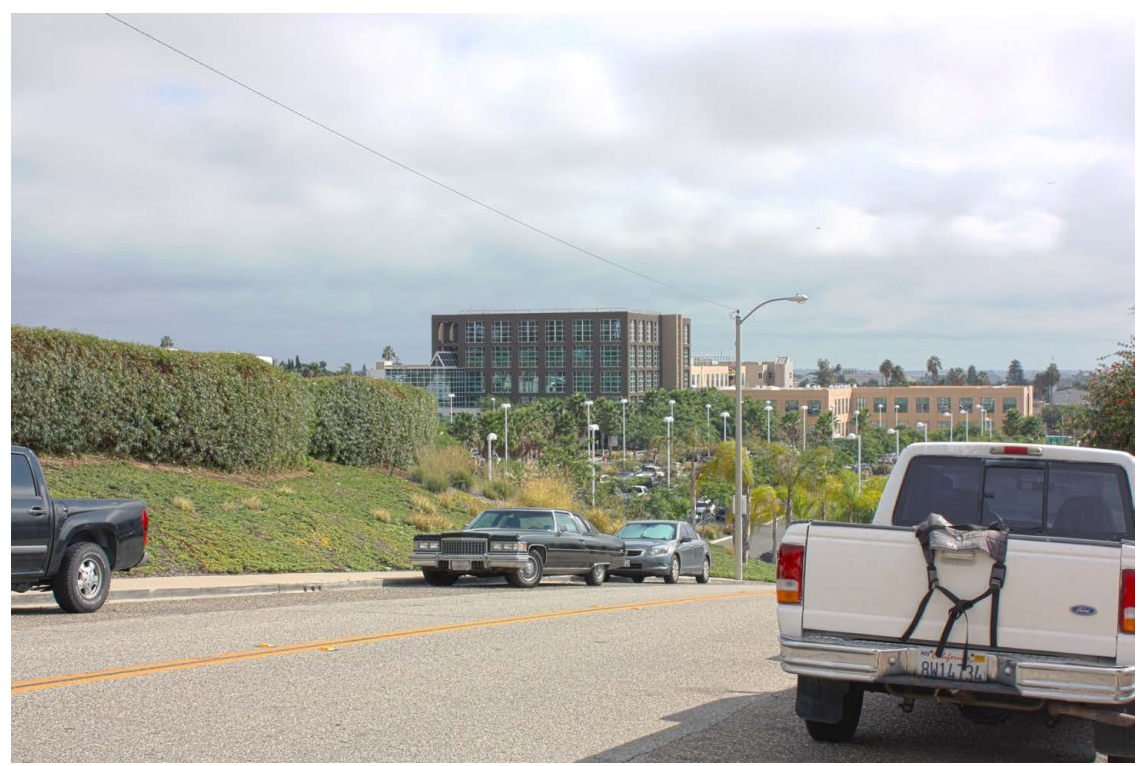
Simulated view from the intersection of Foothill Road and Hillmont Ave