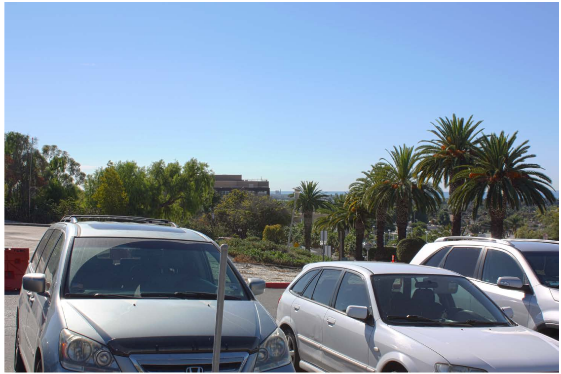
Existing view from just east of the intersection of Foothill Road and Hospital Road