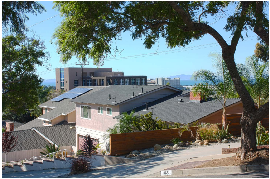
Existing view from Agnus/Fairmont