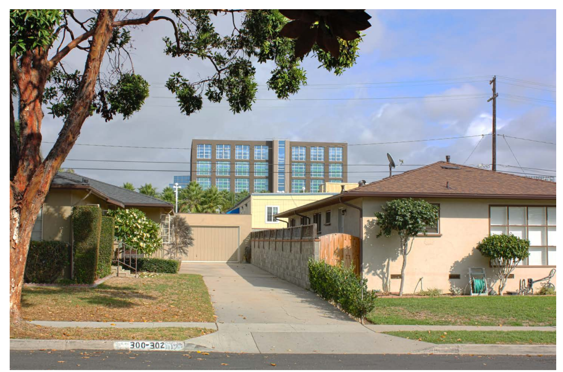
Simulated view from Estrella Street