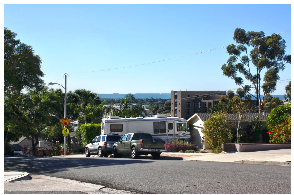
Existing view from the intersection of Agnus Drive and Fairmont Drive