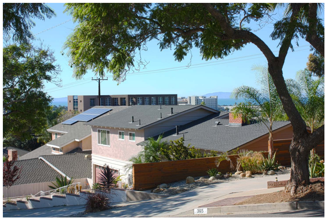
Simulated view from Agnus/Fairmont