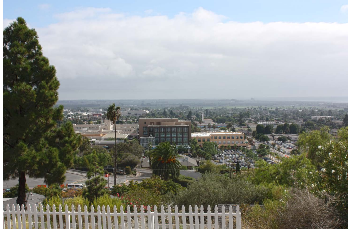
Existing view from Hilltop Drive