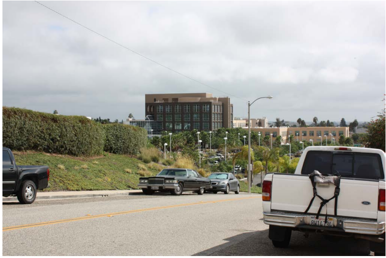
Photo 3: View from the southwest corner of Foothill Road and Hillmont Avenue looking southeast.