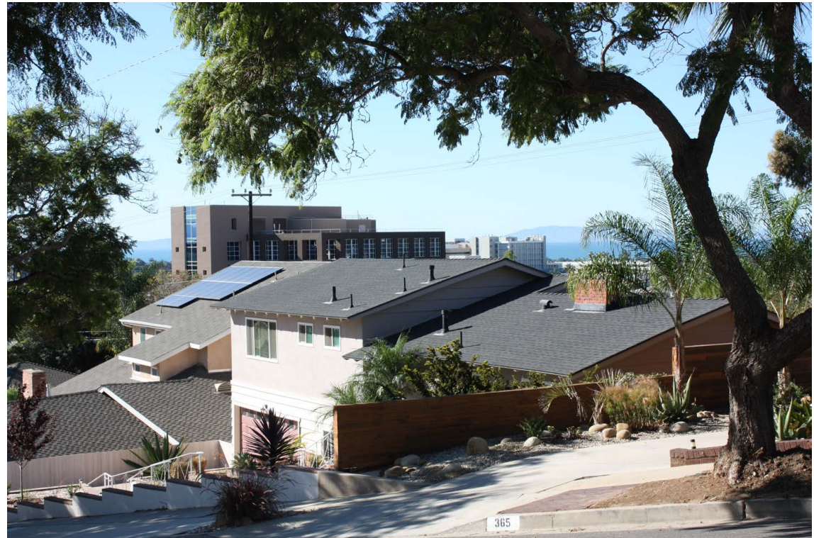
Photo 1: Looking southwest from Agnus Street at the Community Memorial Hospital (white building in background) behind the ACC building.