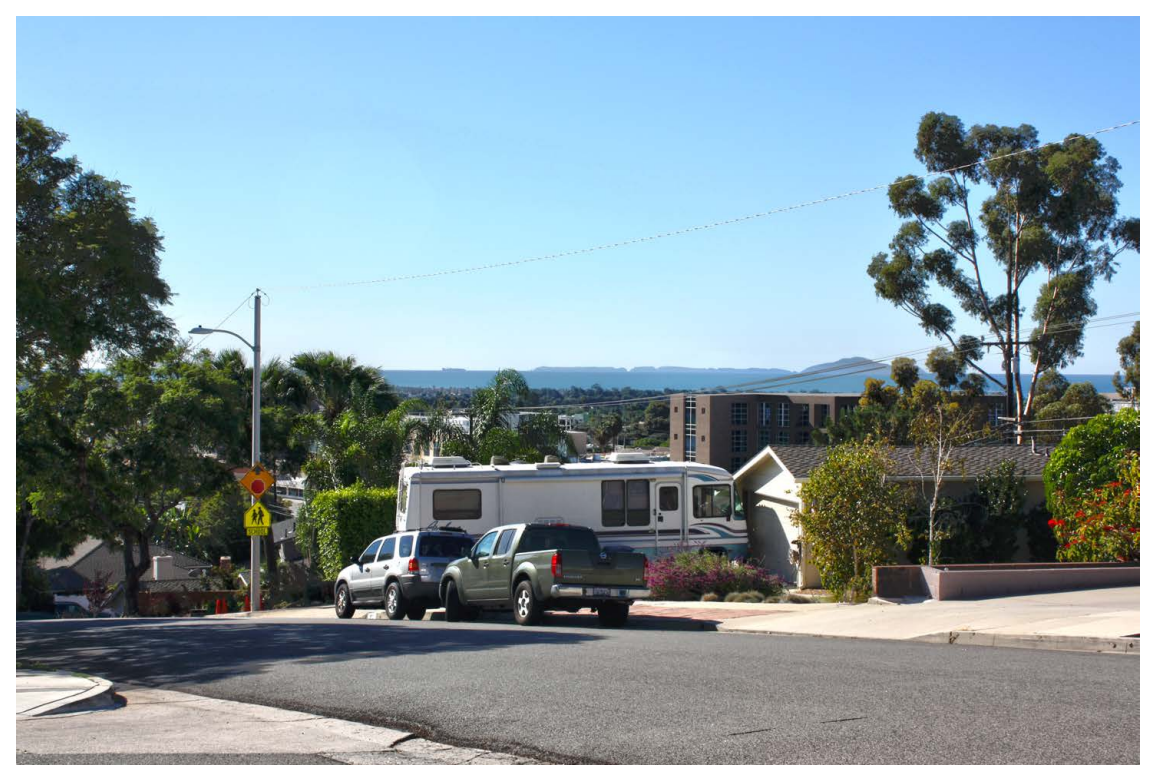
Simulated view from the intersection of Agnus Drive and Fairmont Drive