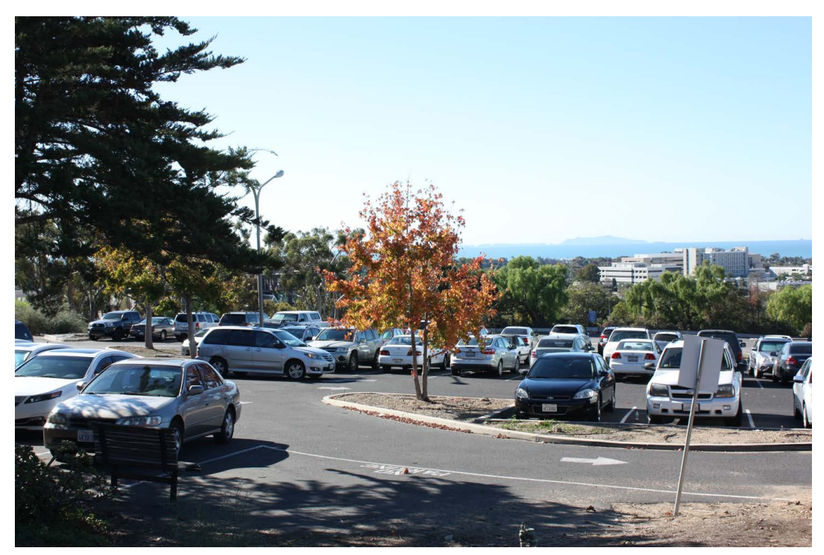
Photo 2: Looking south from Foothill Road (just west of Agnus Drive) at the Community Memorial Hospital to the west (white building in right portion of the photo). View of the ACC is obstructed by vegetation.

Views of the ACC and the Community Memorial Hospital Figure 7