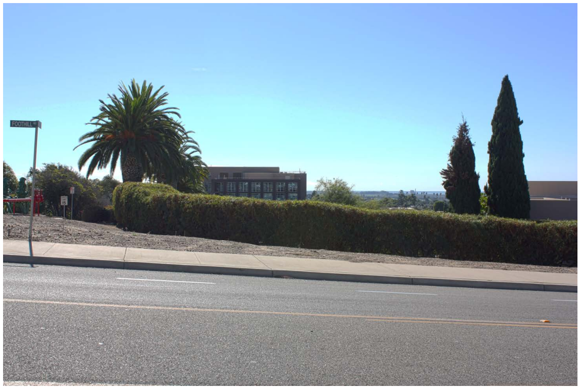
Existing view from just west of the intersection of Foothill Road and Hospital Road