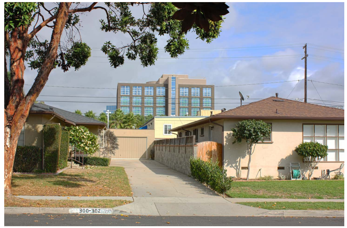
Existing view from Estrella Street