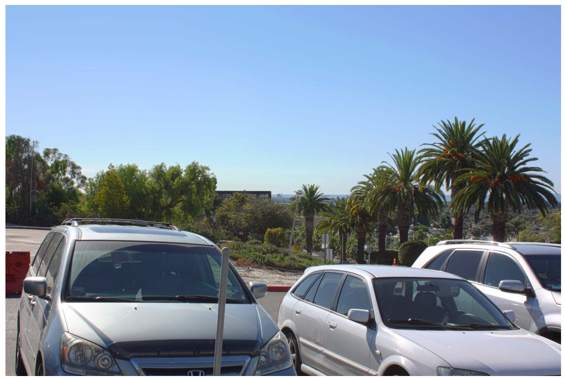
Simulated view from just east of the intersection of Foothill Road and Hospital Road