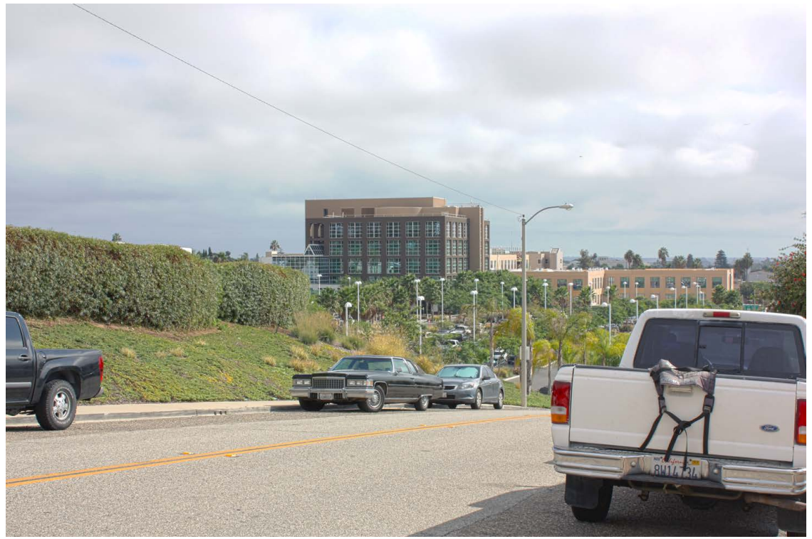
Existing view from the intersection of Foothill Road and Hillmont Ave