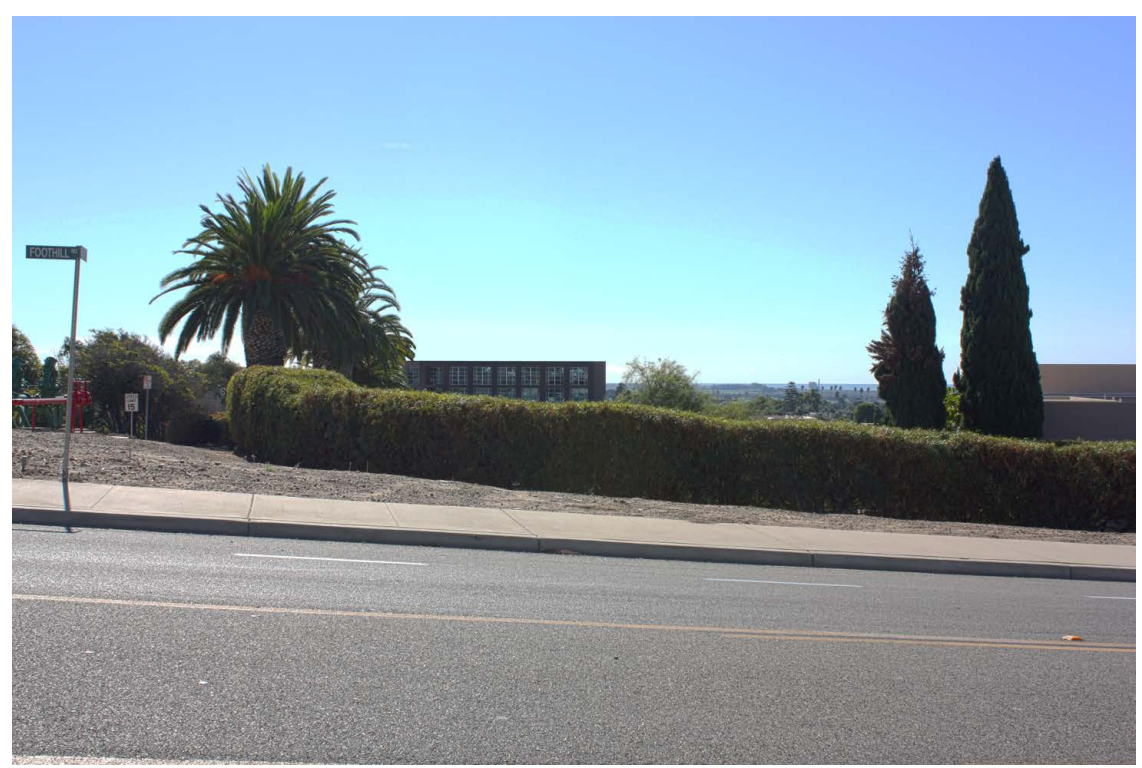
Simulated view from just west of the intersection of Foothill Road and Hospital Road