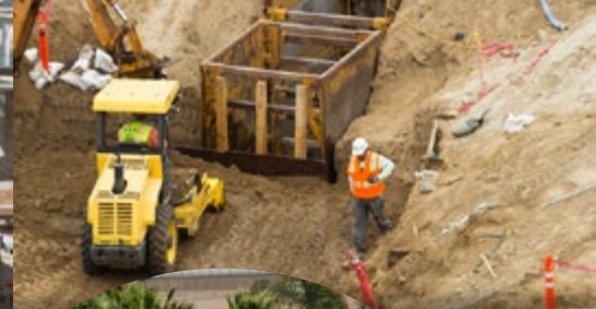
Demolition Day at VCMC for the new Hospital Replacement Wing.