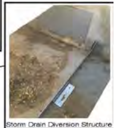
Storm Drain Diversion Structure